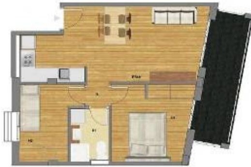
2 bedrooms and 1 bathroom